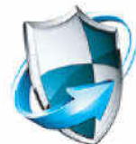
Long life protection