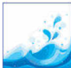
Protect against salt water