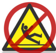
Non Slip Surface