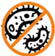
Grim & Mould Protection